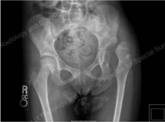
Fig. 1: AP x-ray demonstrating a dysplastic, dislocated left hip and coxa valga (abnormal alignment) of the right hip.